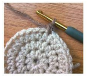
With right side facing, join 2nd color with sc in any hdc

Rnd 4: With right side facing, join 2<sup>nd</sup> color with sc in any hdc, sc in next 3 hdc, *Beg-Fhdc in next hdc, Fhdc 4 times, ch 3, hdc in base of each of the 5 Fhdc just made, hdc in next hdc, sc in next 4 hdc; repeat from * around to last 2 hdc, Beg-Fhdc in next hdc, Fhdc 4 times, ch 3, hdc in base of each of the 5 Fhdc just made, hdc in last hdc; join with slip st in first sc. (20 sc, 25 Fhdc, 25 hdc, and 5 ch-3 spaces)