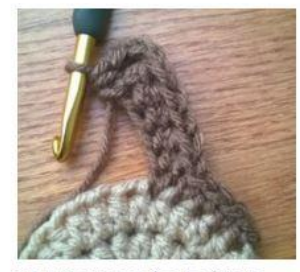
Hdc in base of each of the 5 Fhdc just made