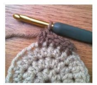
Yarn over and draw through 3 loops on hook to complete the Beg-Fhdc.