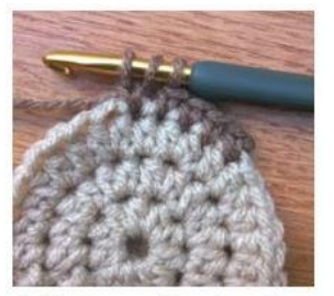
Yarn over and draw through one loop on hook. ("v" just below hook is "chain")