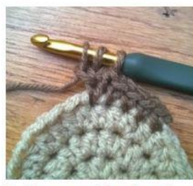
Yarn over and draw through one loop on hook (the "chain")