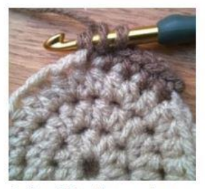
Start Fhdc = Yarn over, insert hook into the "chain" of the previous stitch and pull up a loop. (photo shows through yarn over before pulling up loop).