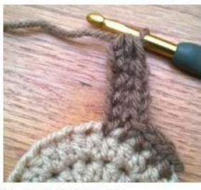
Work 3 more Fhdc (1 Beg-Fhc + 4 Fhdc = a total of 5 Fhdc)