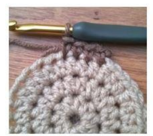
2. Sc in next 3 hdc, sc in any hdc