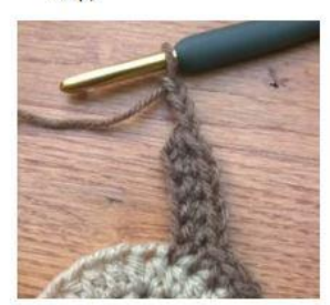
10. Ch 3