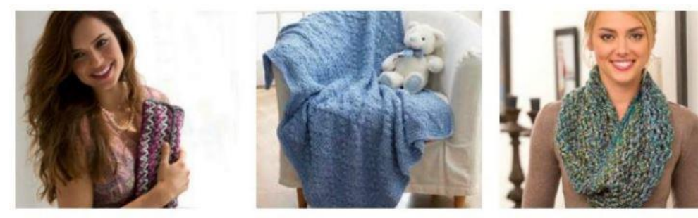
Sign up for All Free Crochet's Free Newsletter

Working into the side of last sc worked, hdc, *ch 1, skip one sc row, hdc.* Repeat *to* around the outside of the dishcloth. When you come to the corner work a hdc, ch 1, hdc in the corner and then continue on making sure that you are always separteing each hdc with a single ch 1. Join to the begining hdc with a sl st, break yarn and weave in ends.