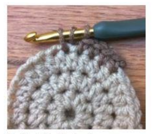
Start Beg-Fhdc = Yarn over insert hook in indicated stitch and pull up a loop