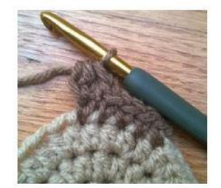
Yarn over and draw through 3 loops on hook to complete the Fhdc